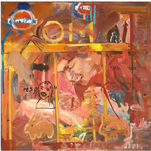
Jarl Ingvarsson, Mötet , 1982, Moderna Museet, Stockholm, Sweden